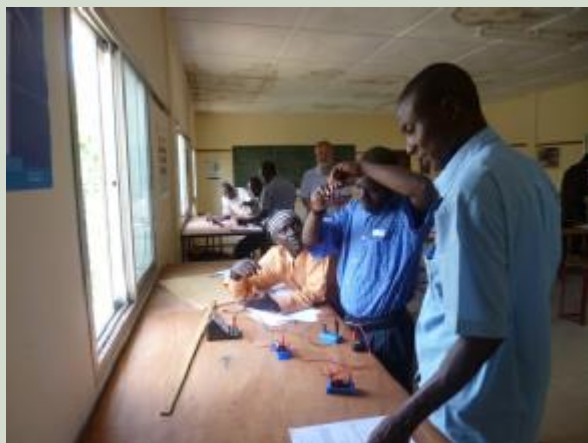
Photo: Experimenting with electrical circuits at a Teacher Development Workshop

The programme aims to work with 30-40 students in groups of around 15 drawn from several schools which are already connected with Raise Gambia where the students can then become science ambassadors.