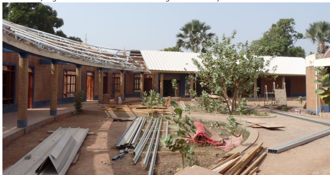
The Marlborough Brandt Group

The Marlborough Brandt Group is a Company Limited by Guarantee, registered in England and Wales, registration no. 0256 7458 and registered charity no 1001398.