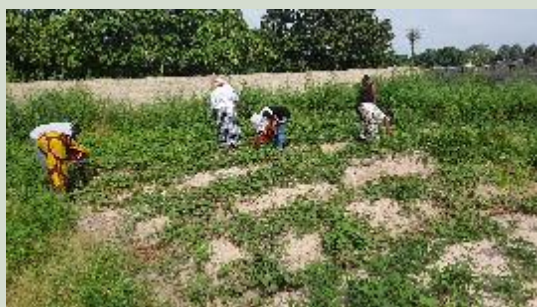
Kabilos managing their OFSP fields

The focus this year was mainly the consolidation of Mother Clubs in the promotion of the micronutrient rich crop varieties at the same time working with the community kabilos to raise their understanding of the values of whole grain consumption of Pearl Millet and the Orange Flesh Sweet Potatoes (OFSPs).