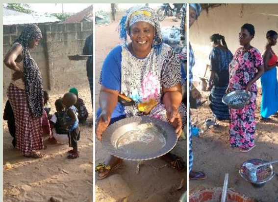
Cooking demonstrations with young mothers

During the cooking demonstrations the project staff sensitise participants about the increasing prevalence of Diabetes and related diseases in Gunjur for people to choose food rations for dietary management and healthy living. Nearly all the participants are aware of diabetes and are discussing at family levels.