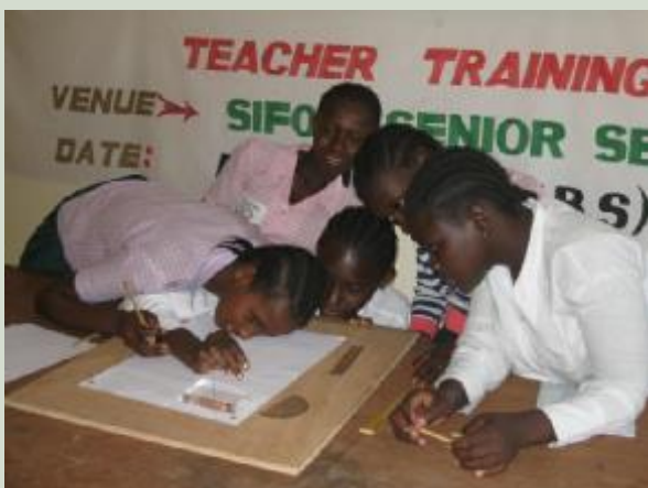
Photo: Local students engaged in Refraction of Light experiment