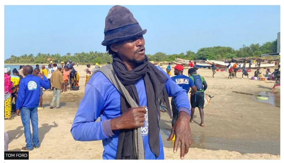
Fishermen say the factory has upset the market as it buys in bulk and pays lower prices than other buyers